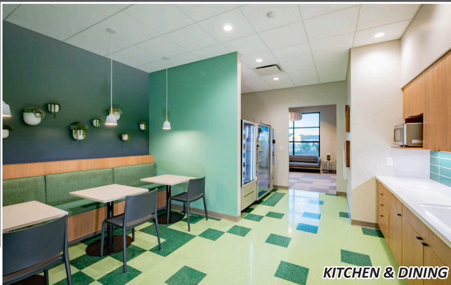
KITCHEN & DINING